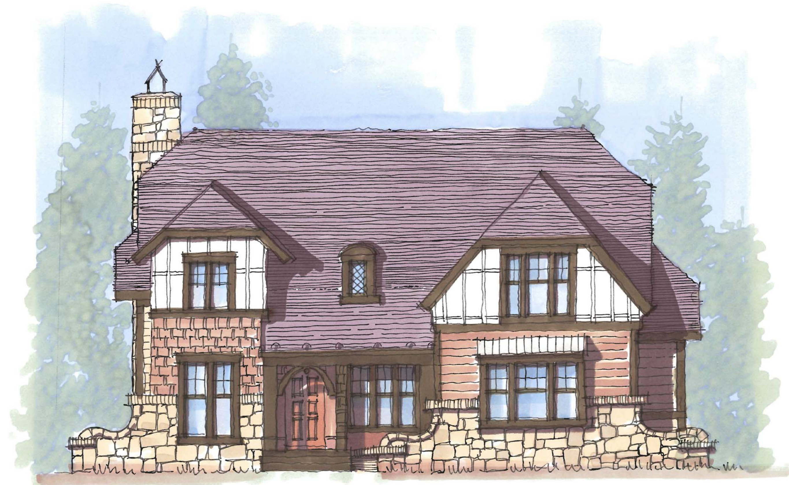
① The Cottswald Ballad Illustrative Rendering