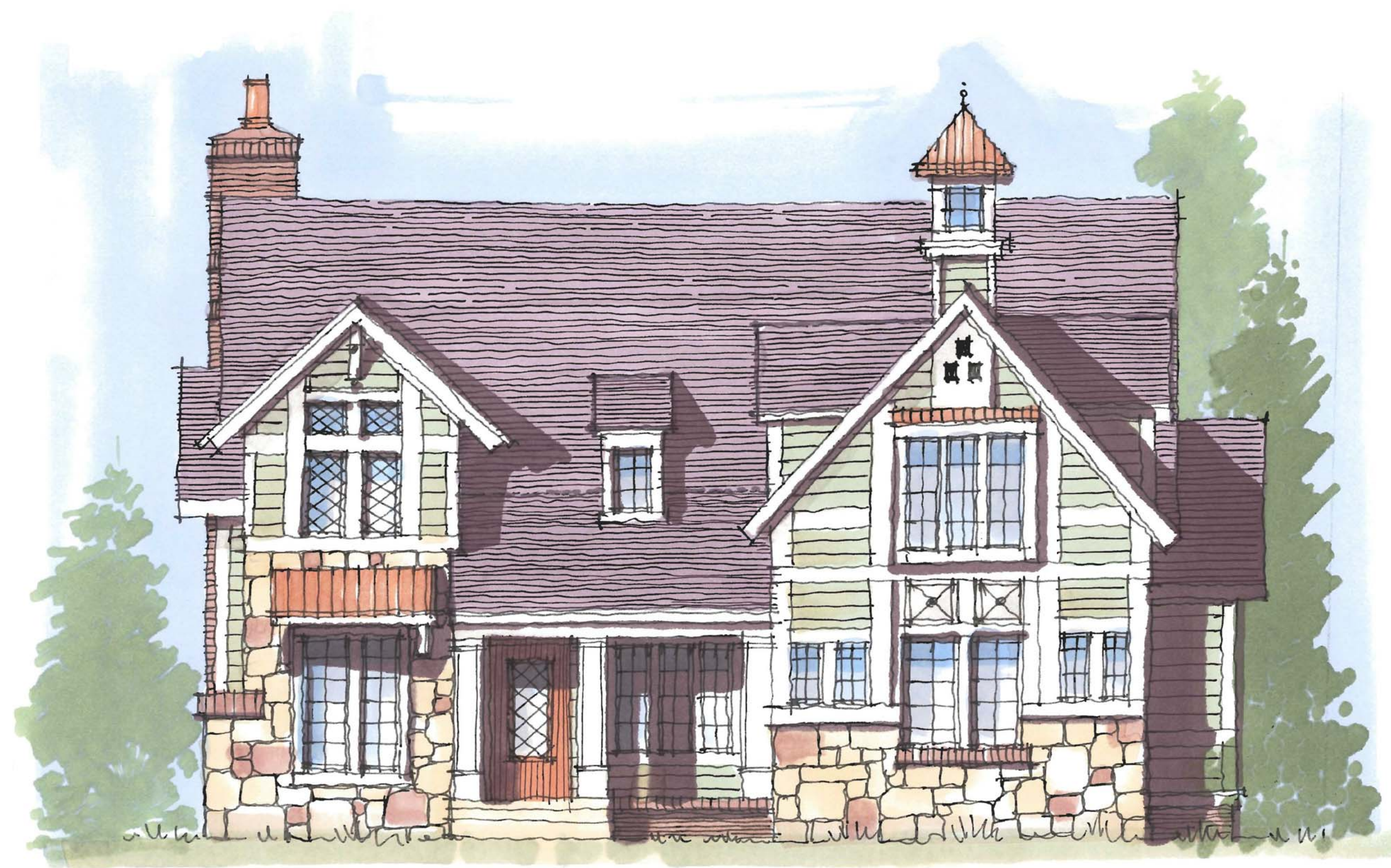
② The Cottswald Romance Illustrative Rendering